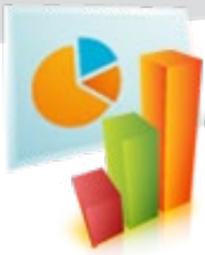
Polling in PowerPoint